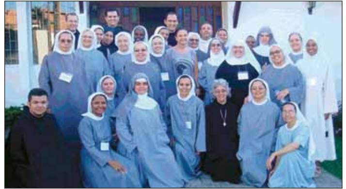
Participants in the CIMBRA Conference

The support of AIM USA made it possible for CIMBRA (the Brazilian Monastic Conference) to hold the first session of a two-year Program for Formators in November 2010.