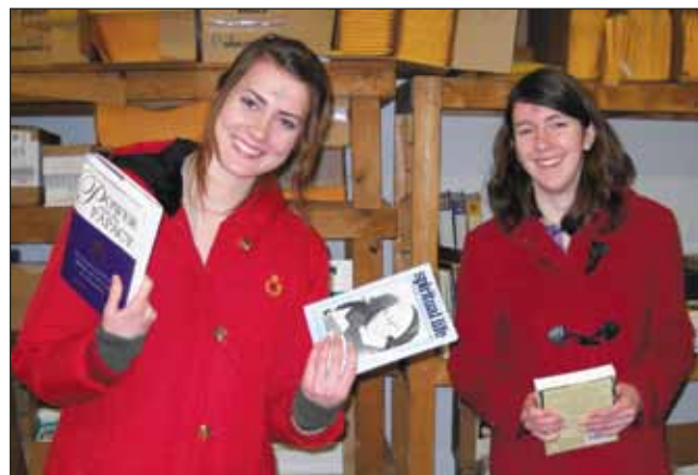
Two Ohio Wesleyan students working in the book room during their semester break visit to Erie.